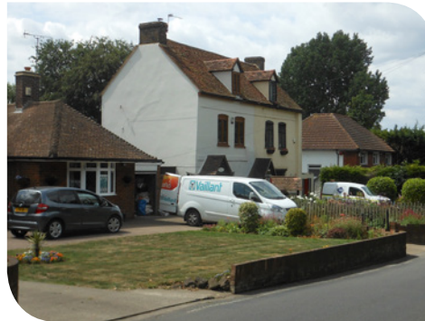
Varied size of building