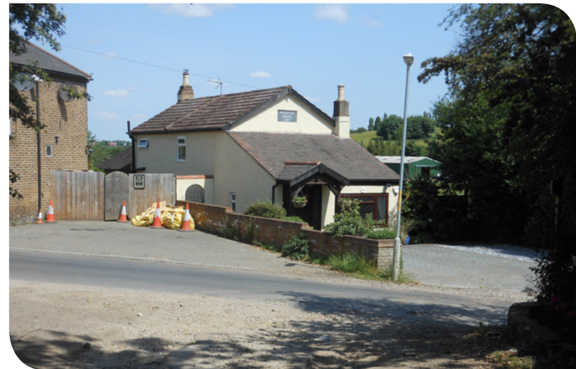
Lack of front boundaries detracts from the character of the conservation area