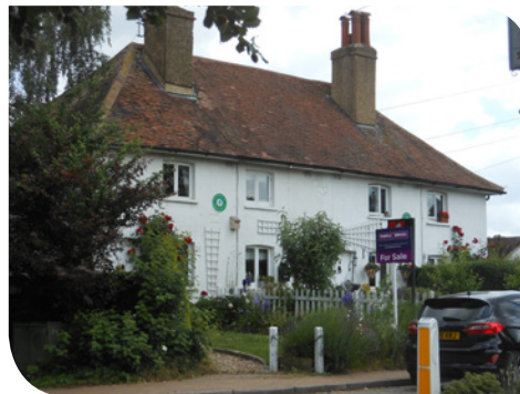
Unbroken roof slopes