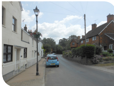
Brick paving and historic replica lamp post