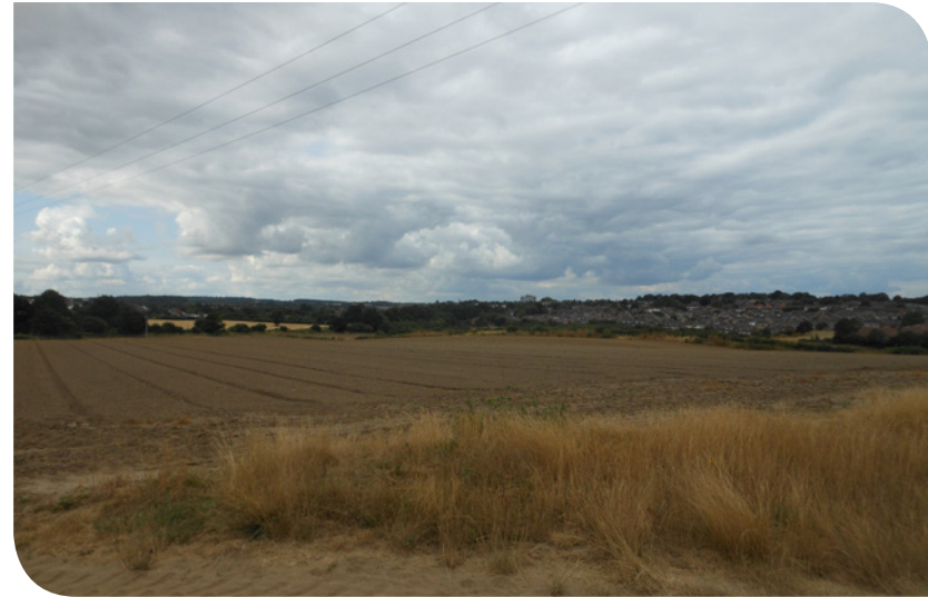
Land to the south-west of the conservation area looking towards Swanley