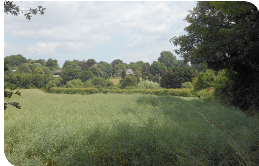
Land to the north-west of the conservation area