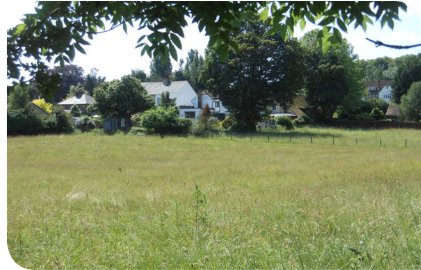
Land to the rear of Swanley Village Road (north side)