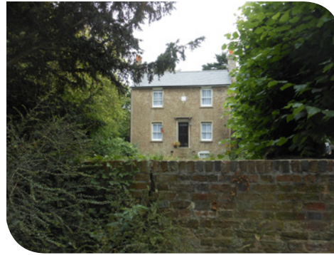
Simple building forms