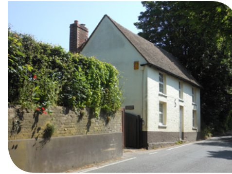
Unbroken roof slopes