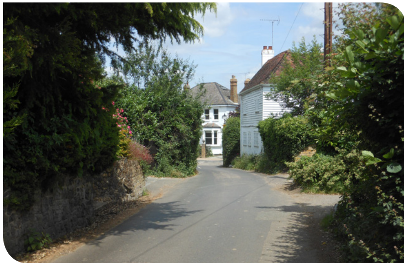
View 3: view along Beechenlea Lane towards Swanley Village Road

Important views have been identified and are shown on the Interactive map at the front of this appraisal. Such a list of views cannot be definitive, but illustrates the nature of views that are important to Swanley Village Conservation Area.