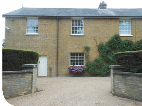
Yellow brick and slate roofs