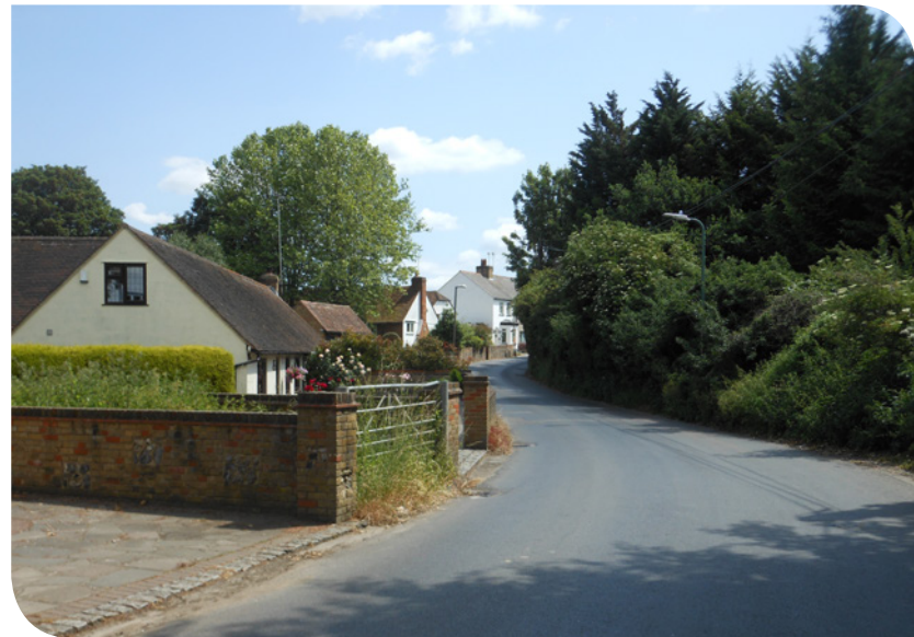
Contrasting areas of looser and denser texture