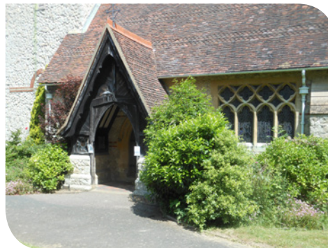
Clay tile roofs