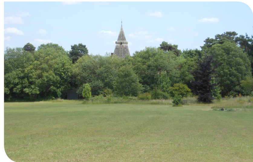
View 5: view of the church spire from the village green