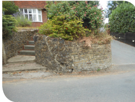
Stone and brick retaining wall