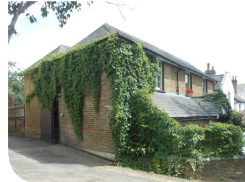
Yellow brick and slate roofs