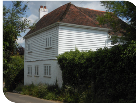
Weatherboarding and brick covering timber frame