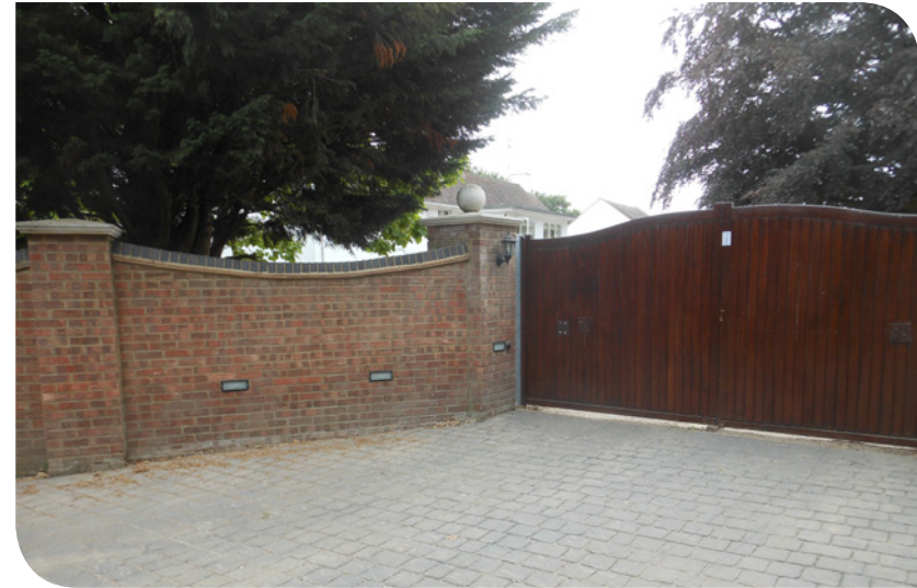
Modern boundary treatment of inappropriate suburban character