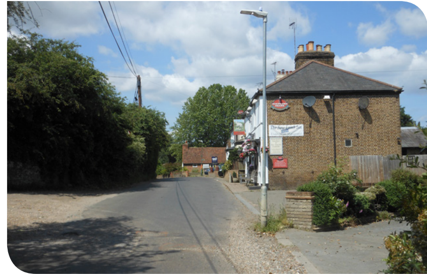
View 7: view of Swanley Village Road